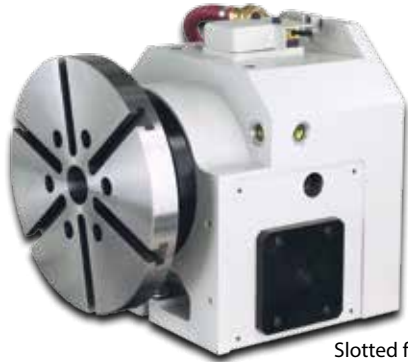
Slotted faceplate sold separately.

Hardinge's world-renowned collet-ready A2-5 spindle is the heart of the system. The same accuracy, precision and reliability built into the Hardinge lathe extends to a large capacity rotary indexer. A variety of standard 16C or 3J spindle tooling will mount directly in or on the spindle without the use of an adapter. Common spindle tooling can now be shared between a rotary unit and a lathe.