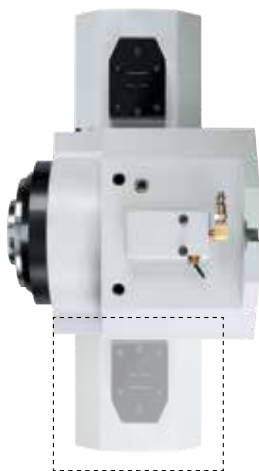
Top view of 16C2 Rotary Indexer – Configure for either left- or right-hand application.