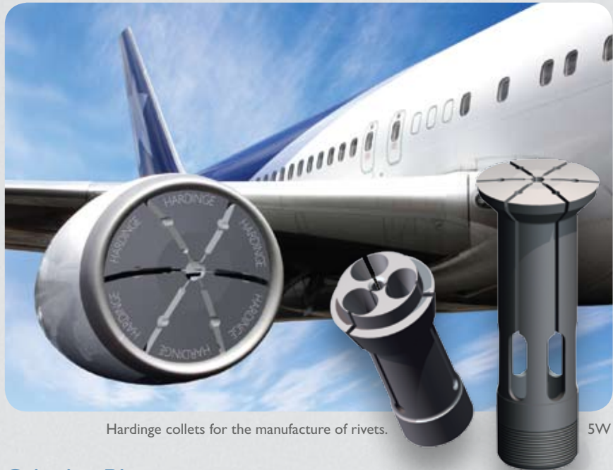
Hardinge collets for the manufacture of rivets.